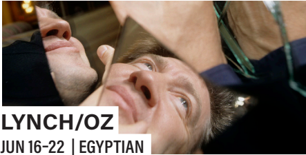
LYNCH/OZ JUN 16-22 | EGYPTIAN

Through six perspectives and narrated by some of contemporary cinema's most exciting voices, LYNCH/OZ helps re-experience and re-interpret The Wizard of Oz by way of David Lynch, to deliver a whole new appreciation for Lynch's symbolism through the lens of his greatest influence.