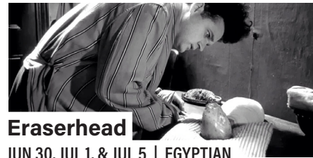
Eraserhead JUN 30, JUL 1, & JUL 5 | EGYPTIAN

After learning his estranged brother has suffered a stroke, Alvin Straight makes up his mind to visit his ailing brother. Unable to obtain a drivers license, he mounts his John Deere lawnmower to make the 260-mile course to make amends with his brother before it's too late.