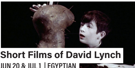
Short Films of David Lynch JUN 20 & JUL 1 | EGYPTIAN

A college student finds a severed human ear, leading to his discovery of the debauched criminal underworld lurking behind the picket fences in his small town.