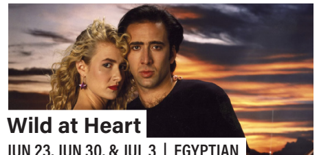
Wild at Heart JUN 23, JUN 30, & JUL 3 | EGYPTIAN

You may know the Timothée Chalamet/Zendaya Dune , but what about the first adaptation of the prolific Frank Herbert novel? David Lynch attempted to ride the sandworm into success in 1984, what resulted is a mind bending, classic 80's CGI, spice induced ride.