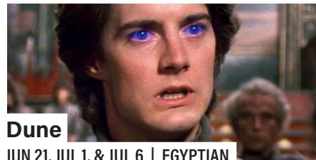
Dune JUN 21, JUL 1, & JUL 6 | EGYPTIAN

Spanning Lynch's career, from early experiments to more fully realized visions, come and witness short films "Six Men Getting Sick," "The Alphabet," "The Grandmother," "The Amputee," "The Cowboy and the Frenchman," and "Lumiere."