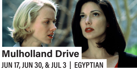
Mulholland Drive JUN 17, JUN 30, & JUL 3 | EGYPTIAN

Through six perspectives and narrated by some of contemporary cinema's most exciting voices, LYNCH/OZ helps re-experience and re-interpret The Wizard of Oz by way of David Lynch, to deliver a whole new appreciation for Lynch's symbolism through the lens of his greatest influence.