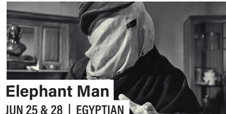
Elephant Man JUN 25 & 28 | EGYPTIAN

Lynch's first foray into fully digital filmmaking allowed for an unprecedented level of improvisation. Eschewing any semblance of narrative, Inland Empire pays homage to some of the greatest works of surrealism while remaining startlingly unique.