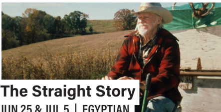
The Straight Story JUN 25 & JUL 5 | EGYPTIAN

In this prequel to his groundbreaking 1990s television series, David Lynch resurrects the teenager found wrapped in plastic at the beginning of the show, following her through the last week of her life and teasing out the enigmas that surround her murder.