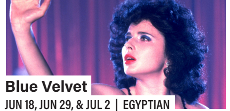
Blue Velvet JUN 18, JUN 29, & JUL 2 | EGYPTIAN

Blonde Betty Elms has only just arrived in Hollywood to become a movie star when she meets an enigmatic brunette with amnesia. As the two set off to solve the second woman's identity, a filmmaker runs into trouble while casting his latest project.