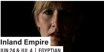
Inland Empire JUN 24 & JUL 4 | EGYPTIAN

David Lynch directs this hallucinatory crime thriller about runaway convicts and forbidden love, blending elements of The Wizard Of Oz and Elvis Presley fetishism with an eclectic, intense soundtrack.